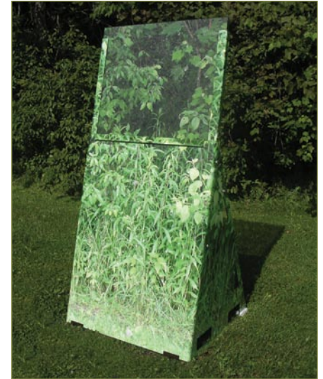
Camography can be applied to units of any resistance level and do not alter the level of protection provided by the unit.

Camography can also be applied to the transparent armor panel of the unit with a one-way see-thru film. Units used in diplomatic or government facilities may use images of wood paneling, ceramic tiles, or other architectural materials. Outdoor protection could include images of gardens, rock walls, heavy woods, or similar settings. Images can also be taken of the location where the unit will be deployed. The match is exact in color, and scale. The transparent armor panel may be tinted, reflective, or utilize the one-way Camographic film to achieve maximum concealment.