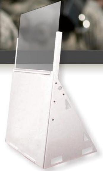
DS-180 Stationary Unit Heavy duty unit used primarily at fortified entry control points. Provides full coverage and stability via lag plates, and withstands environmental elements such as UV and precipitation. Customized signage available for visual communication and identification.

When a soldier, guard, observer or negotiator is behind a Defenshield MDFP, they become the highest form of deterrence. MDFP's are available in four levels of protection to satisfy the ballistic threat and mobility requirements of a wide variety of users. Custom sized units are also available.